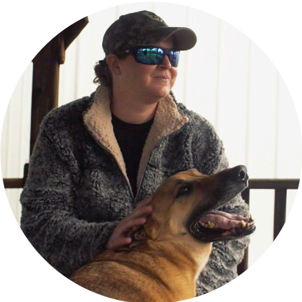
Survivor Enjoying Quality Time with One of Our Therapy Dogs

Who We Are: The Center for Violence Prevention advocates that every person has the right to a life free from violence. Our committed staff focuses on the needs of each client by providing specialized programming and partnering with multiple community organizations.