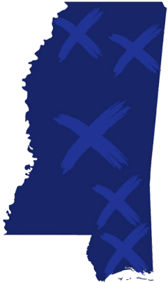
Rapid Responders Across the State

Safety, Shelter, and Advocacy: We operate The Tower, the only specialized human trafficking shelter in Mississippi, to assist adult victims with their recovery needs. We serve ten central Mississippi counties as a shelter for domestic and sexual abuse victims.