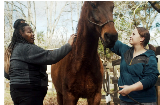
Survivors Participating in Equine Therapy

Empowered Survivors: We help survivors take charge of their own lives through a victim centered approach. The Tower provides individualized services for every case so that each survivor is met with empathy, knowledge, and action planning to build his/her future.